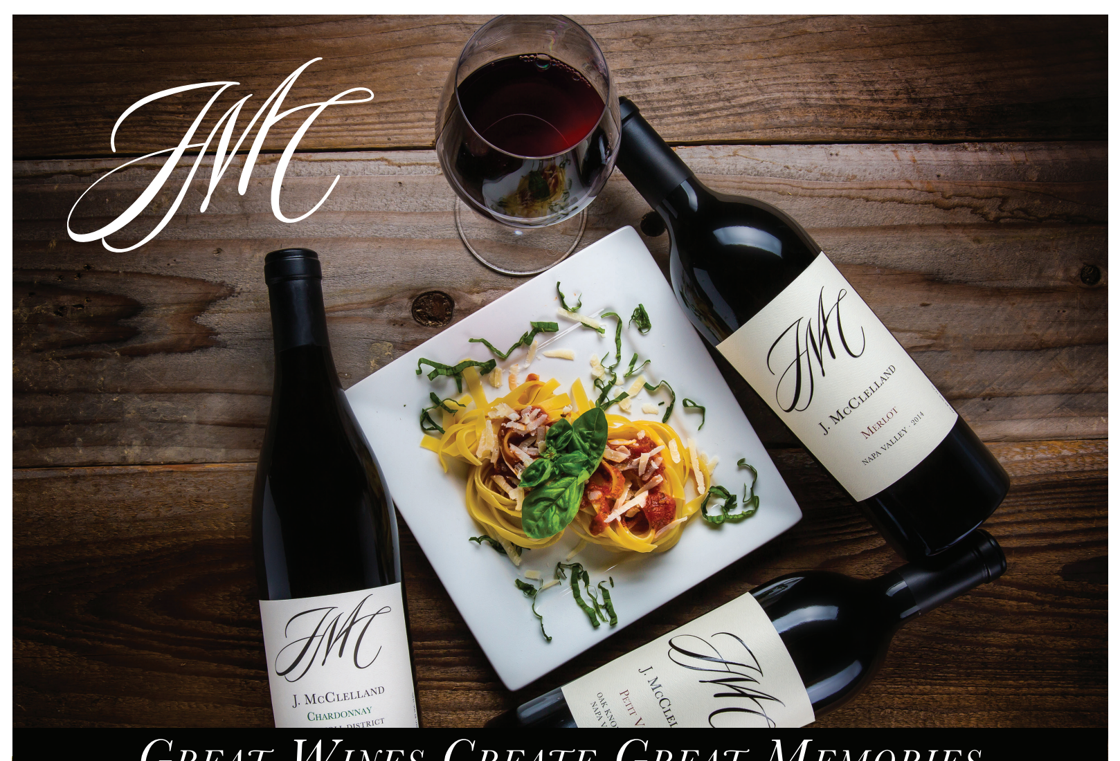
Great Wines Create Great Memories